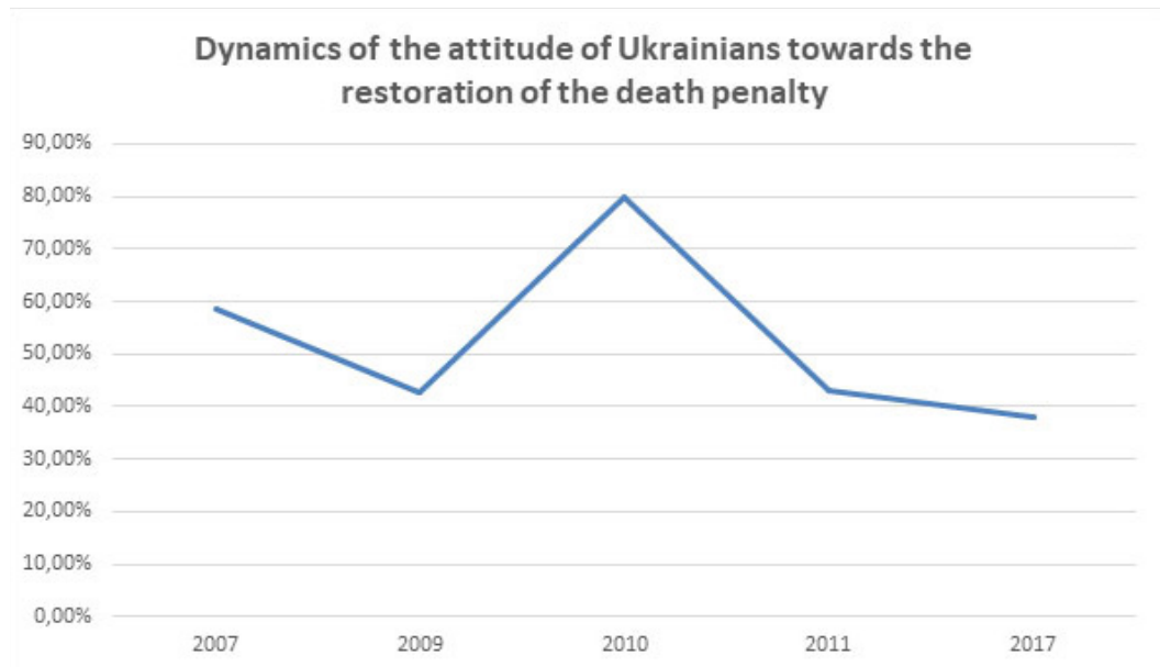
Figure 1. Dynamics of the attitude of Ukrainians towards the restoration of the death penalty.

In the first decade of the 21 st century, many Ukrainians advocated the restoration of the death penalty (Figure 1), with the highest percentage of supporters at about 80 % in 2010 (80 % of Ukrainians support the death penalty).