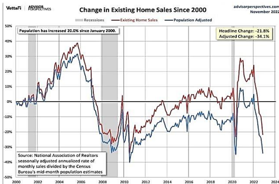
Figure 1 – Existing home sales dynamics in USA (Katsenelson, 2022)

From January, 2022 to November, 2022, existing home sales plummeted from 6.5 million a year to 4.09 million a year (minus 37 %) with sustained momentum to renew the low of the COVID crisis (about 4 million sales in mid-2020). In monetary terms, current sales are approximately $ 320-330 billion per year compared to $ 530-550 billion in 2021 (volumes are falling and prices are falling). Nearly 200 billion revenue cut-off and only one segment – new single-family homes (Katsenelson, 2022).